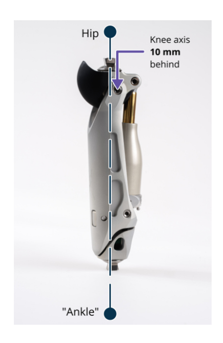
Fig 2.1: Alignment of VGK-Go!.