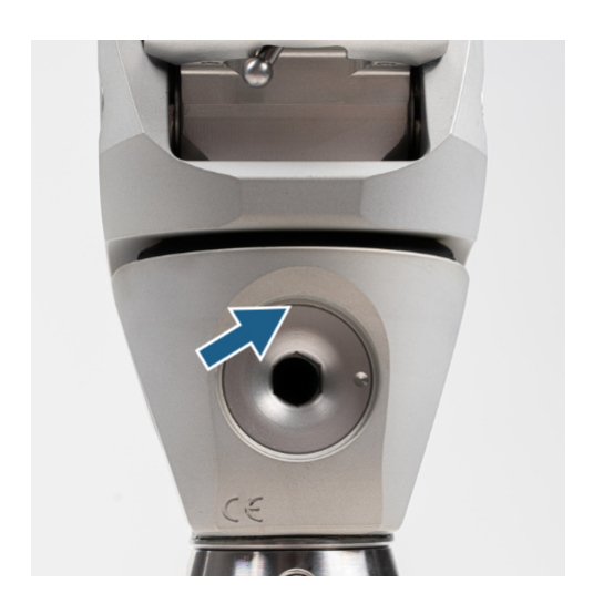
Fig 1.1: Location of serial number

The VGK-Go! must be stored in an extended position.