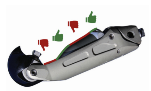
Fig 2.3: Kneeling onto the cylinder is permissible when the contact point is in the green regions