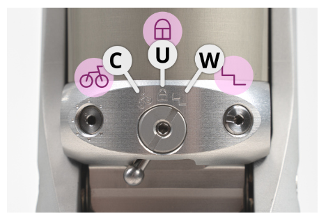
Fig 3.2: Positions of the Stance Flexion Handle